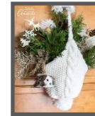
Winter Hat Door Hanger Tues. Jan. 6