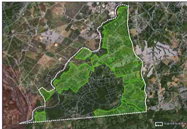
Sugarloaf Rural Heritage Overlay District Rural Heritage Overlay District