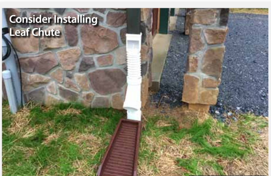
Leaves and debris are washed out onto the ground keeping your ground pipes flowing freely.

Dry wells are typically used to treat small drainage areas (500 sq. ft.). They are not appropriate for treating large areas like parking lots. Most dry wells are buried and grass covered, but they can be easily recognized by a white observation cap that is located about 10-20 feet from the house.